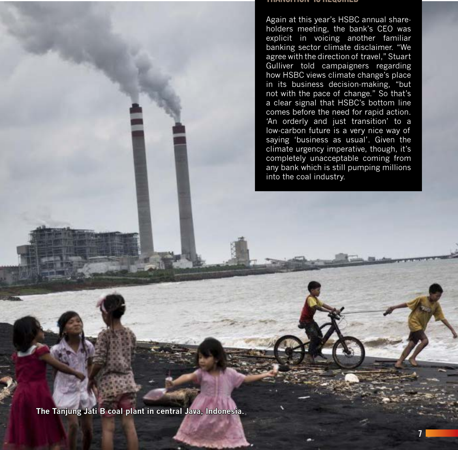
The Tanjung Jati B coal plant in central Java, Indonesia.

Again at this year's HSBC annual shareholders meeting, the bank's CEO was explicit in voicing another familiar banking sector climate disclaimer. "We agree with the direction of travel," Stuart Gulliver told campaigners regarding how HSBC views climate change's place in its business decision-making, "but not with the pace of change." So that's a clear signal that HSBC's bottom line comes before the need for rapid action. 'An orderly and just transition' to a low-carbon future is a very nice way of saying 'business as usual'. Given the climate urgency imperative, though, it's completely unacceptable coming from any bank which is still pumping millions into the coal industry.