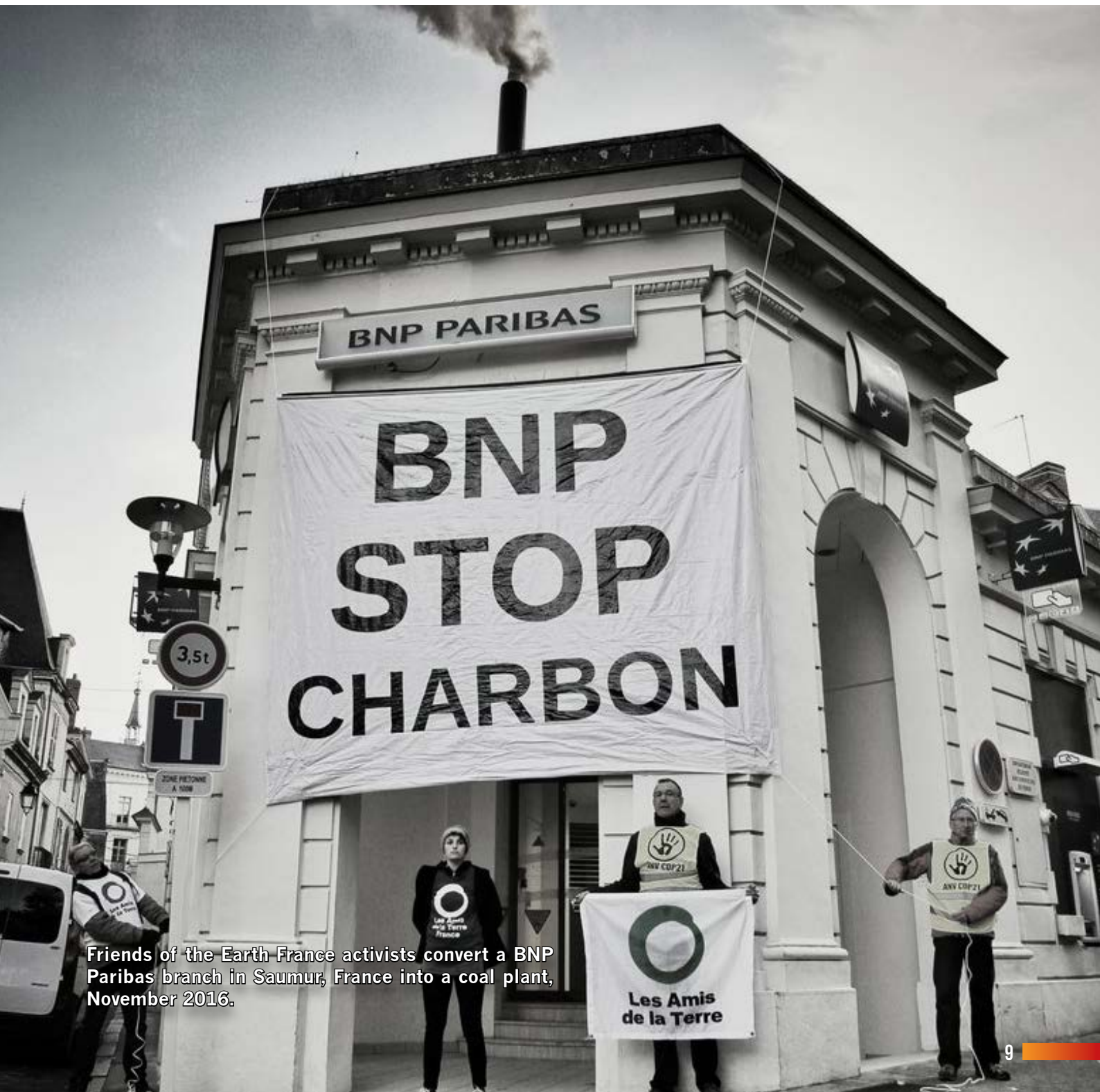
Friends of the Earth France activists convert a BNP Paribas branch in Saumur, France into a coal plant, November 2016.

BNP Paribas, meanwhile, has acknowledged the 2°C target and deemed that the only way to contribute to its achievement is either to encourage its coal clients to align their activity with the 2°C target or to exclude them from support. Thus, the bank is maintaining its support for coal miners and coal utilities, but only those which have a diversification strategy. The reliability of this approach, however, has come under scrutiny, most notably in relation to the bank's dealings with Poland's coal giant PGE, one of Europe's heaviest polluters. Campaigners have questioned why BNP Paribas has failed to exclude PGE from its client list when the company has plans to aggressively expand both its coal mining and coal power activities.